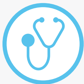
early diagnosis and appropriate treatment

To achieve this goal, the group agreed that the lack of awareness, among all stakeholders, of the increasing risk and impact of thrombosis in cancer patients is the key barrier that needs to be overcome.