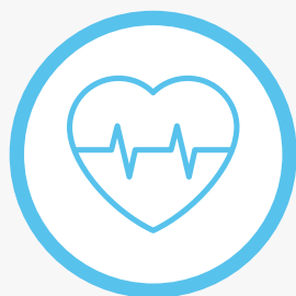
reduce morbidity and mortality