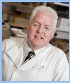
Project Lead, European Cancer Concord (ECC)