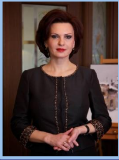
President, European Development Platform