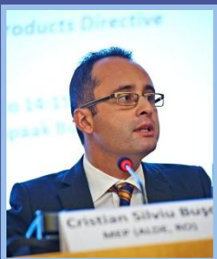
Member of the European Parliament

He has been to the forefront of a number of patient focussed cancer healthcare initiatives at the national and EU level. Over the last two years, he was project lead for the European Cancer Concord (ECC), a pan European initiative involving equal partnership between patients and their advocates and health care professionals, which aims to remove inequalities and improve cancer care for the citizens of Europe. The efforts of the ECC came to fruition with the launch of the European Cancer Patient's Bill of Rights on World Cancer Day, 4th February 2014 in the European Parliament in Strasbourg.