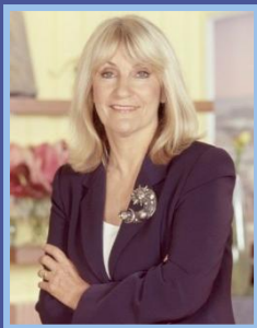
Former ECPC President and co-founder

She has participated in many conferences as a member of the organizing and scientific committee as well as a speaker and trainer / expert in workshops at Greece and other Member States; such as at the European Patients' Forum as an expert in fundraising and strategic planning; training representatives from patients organizations from Greece, Italy, Spain and Portugal.