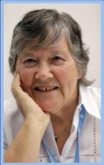
President Independent Cancer Patients' Voice

He is now member of the Biopreserv. Biobank. Editorial board, BBMRI-LPC SEAC, P3G ISC and Dutch PSI UMC coordinator for Erasmus MC.