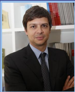
Ph.D. - International Law at the University of Naples II

Among other projects, the European Development Platform has been running since last year the national campaign "Choose Personalised Medicine", a programme aimed to improve the access of Romanian patients to innovative treatments and equality of chances.