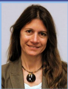
Stakeholder & Communication Division, EMA