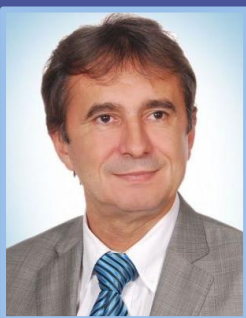
State Secretary Romanian Ministry of Health